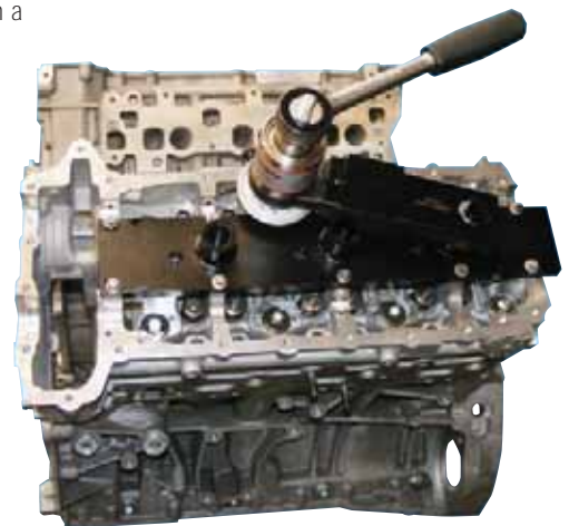
Handtorque multiplier fitted with torque bar adaptor, special torque reaction arm and angle gauge assembly