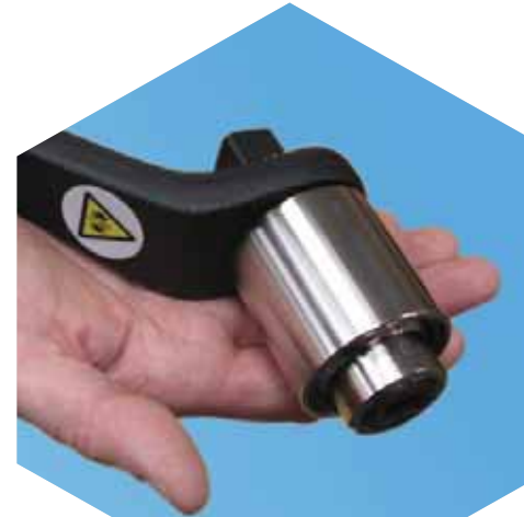
HT-52 1000 N.m Torque Multiplier

To keep major items of plant such as power presses in top condition it is vital to carry out preventive maintenance. This often involves the loosening and tightening of large or awkward fasteners. Norbar specialise in small powerful torque multipliers that make short work of these difficult fasteners. With a Norbar Handtorque™ in your maintenance toolkit and the support of your local distributor for the design of specialised torque reaction arms, you can tackle those difficult jobs in less time and with more confidence.