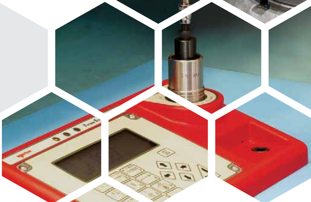
Torque Screwdriver Tester (TST)