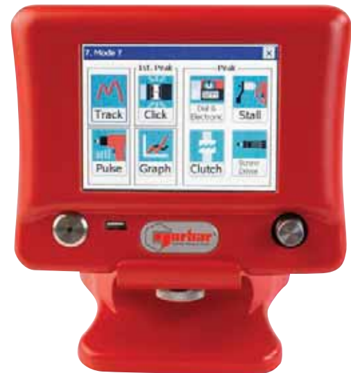
T-Box™ torque and angle measuring instrument

T-Box™ is the latest Norbar measuring instrument, with its TDMS software, designed to store trend data and assist you in setting appropriate recalibration or maintenance intervals.