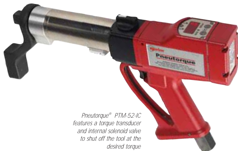
Pneutorque® PTM-52-IC features a torque transducer and internal solenoid valve to shut off the tool at the desired torque