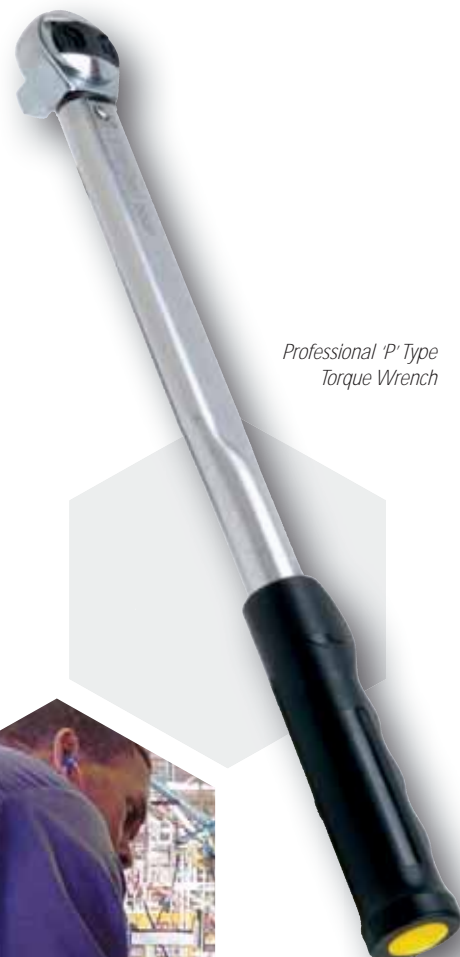
Professional 'P' Type Torque Wrench

Norbar distributors around the world are chosen for their ability to give you local support when you need it. Within our family of distributors we share applications and can often recommend solutions that have been tried and tested elsewhere.