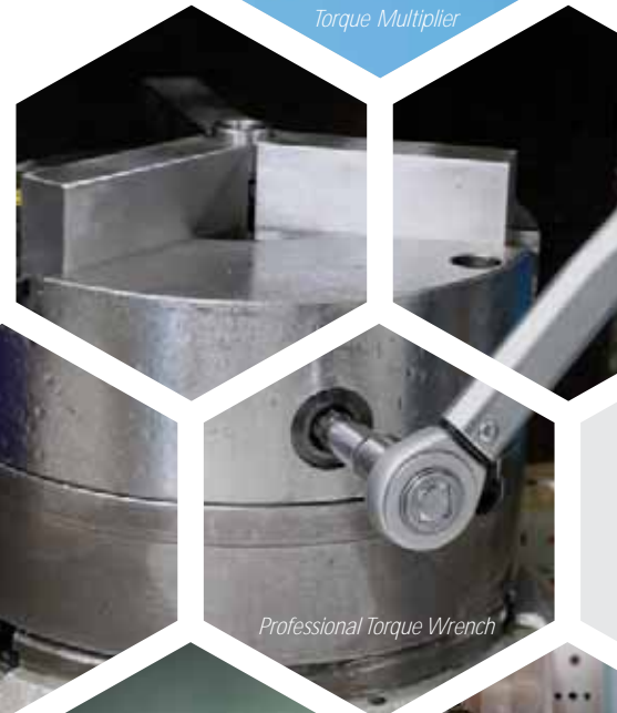
Professional Torque Wrench