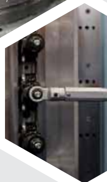
Professional Torque Wrench with ring end fitting